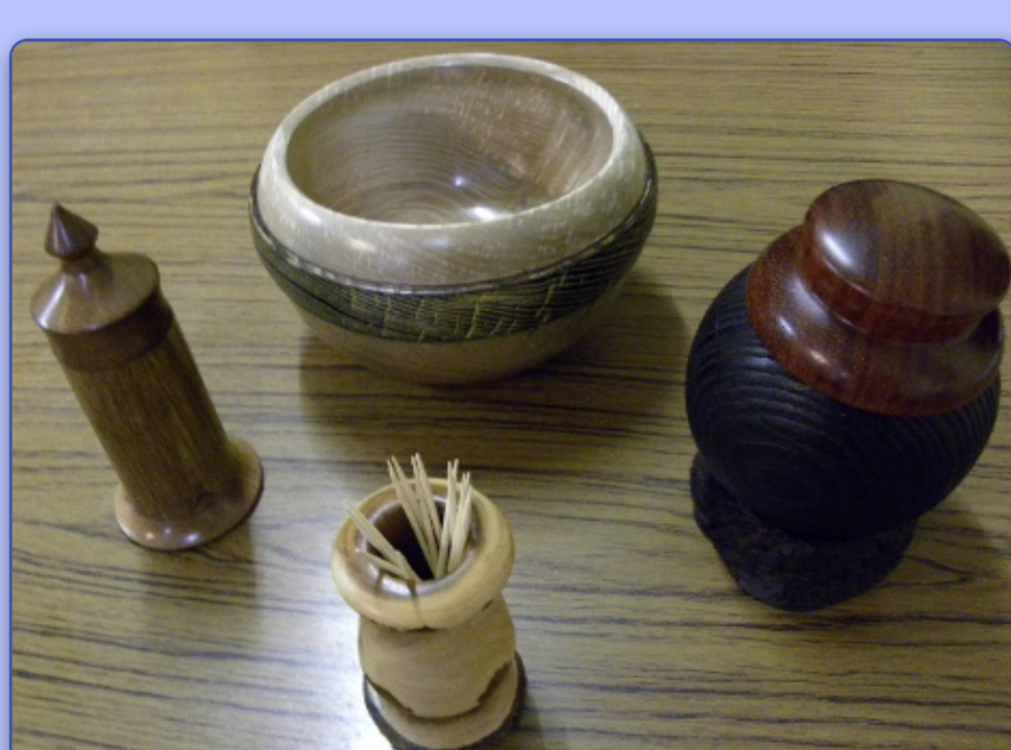
Photo 15 - The Competition Table