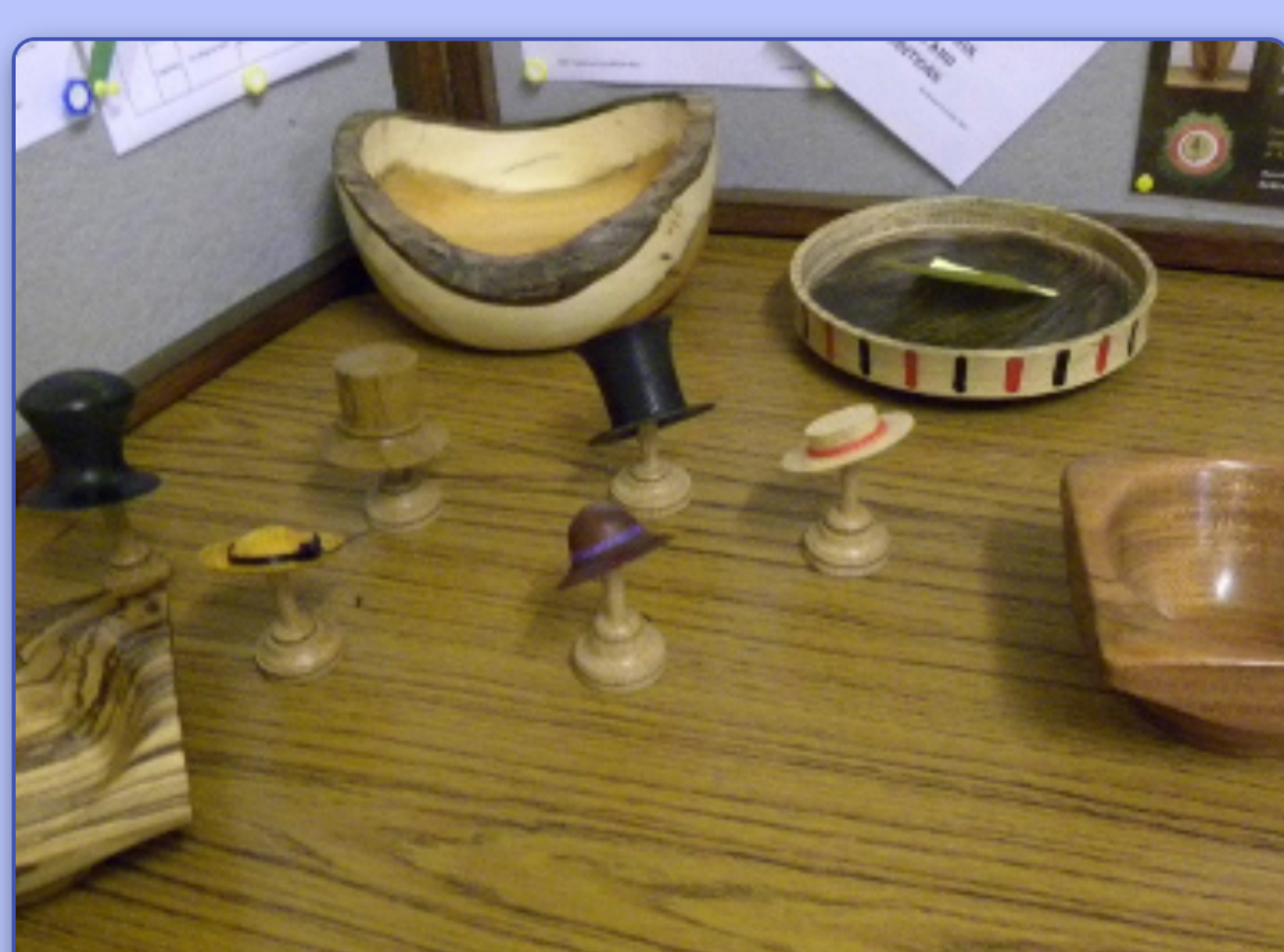
Photo 16 - The Gallery Table