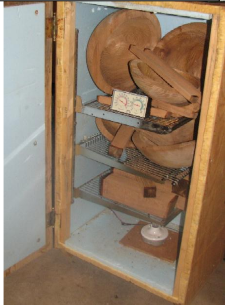
Photo 3 above The current load, made up of three large 14"-16" blanks, the core-outs and some spindle material. It has been in for three weeks and is pretty much near the end of its run. I have coated the endgrain on the larger bowls with wax emulsion on both inside and outside and have had almost zero problems with cracking. I have completed four loads to date and am immensely pleased with the overall results for the time and material investment.

I start raising the temperature after about four to five days, reference marks on the dimmer switch help to reproduce settings. I monitor the temperature with a Taylor Temperature/Humidistat and an old laboratory probe thermometer in one of the ventilation holes. I chart the date, temperature and humidity. I monitor the weight loss of several pieces and record the weights on the piece itself. Every few days, I give the dimmer a small incremental increase. As moisture leaves the wood and the cabinet, the heat energy, which was being used to vaporize the water, gradually increases the temperature of the interior quite significantly. At the end of the drying run, in winter conditions when the garage was colder, the final temperature was about 40° C and relative humidity about 20%. Currently in summer conditions, it is more than 45° C and about 25% RH. Red elm bowl blanks and spindle blanks up to about 2 3/4" x 15" have dried successfully to stable weight in two to three weeks. An 11" natural edge sugar maple bowl with walls just under 1", was ready to second turn in 12 days.