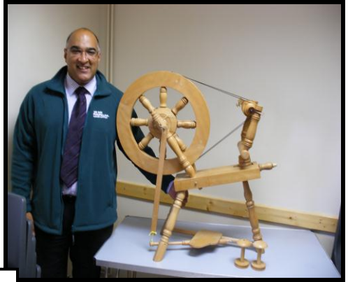
August Turn-In