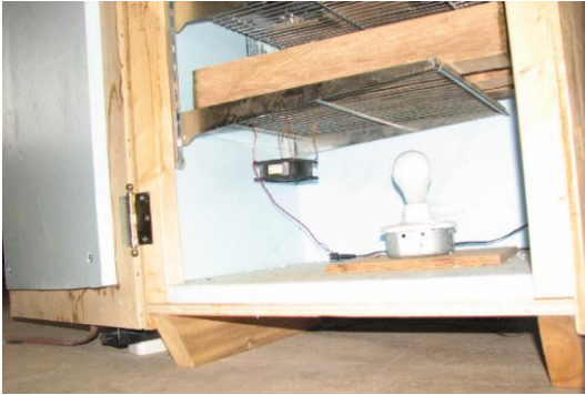
Photo 3 left Here is a photo of the lamp mount and computer fan, which is powered from a 12 volt DC supply.

I start raising the temperature after about four to five days, reference marks on the dimmer switch help to reproduce settings. I monitor the temperature with a Taylor Temperature/Humidistat and an old laboratory probe thermometer in one of the ventilation holes. I chart the date, temperature and humidity. I monitor the weight loss of several pieces and record the weights on the piece itself. Every few days, I give the dimmer a small incremental increase. As moisture leaves the wood and the cabinet, the heat energy, which was being used to vaporize the water, gradually increases the temperature of the interior quite significantly. At the end of the drying run, in winter conditions when the garage was colder, the final temperature was about 40° C and relative humidity about 20%. Currently in summer conditions, it is more than 45° C and about 25% RH. Red elm bowl blanks and spindle blanks up to about 2 3/4" x 15" have dried successfully to stable weight in two to three weeks. An 11" natural edge sugar maple bowl with walls just under 1", was ready to second turn in 12 days.