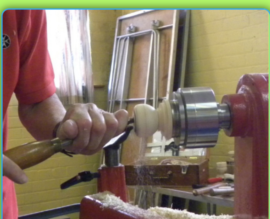
The photo shows the bauble and with the top removed ready for hollowing which you can see in the photo.

Whilst on lathe two I started by explain my take on the bauble using the same techniques as John's but with a twist. The first difference was that I take a 65 mm square section by 100 mm long. Then I drew a line 40 mm from the chucking point end. Find the centre line of the 65 mm width and were the 40 mm meets it I drilled a 9 mm hole right through the piece. It was then placed accurately between centre and a spigot was turned on the end. Mounting it into the chuck it was turned down to a 50 mm cylinder. Then from the centre of the drilled hole a line was drawn 25 mm to the left and a line 12 mm to the right. Using a parting tool on the left of the 25 mm mark I made a groove to a depth of 15 mm. Then the sphere was turned down to the 15 mm witness.